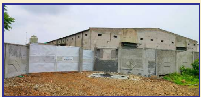
The Company Pipe manufacturing plant is located at Akola, Maharastra